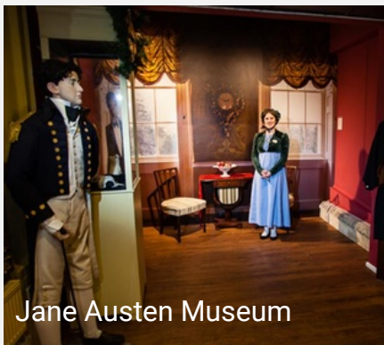
Jane Austen Museum

There will also be time for some shopping, or you may want to organize rowing or punting on the River Isis (* additional cost).