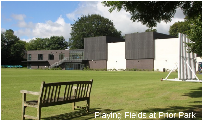
Playing Fields at Prior Park

Our course takes place at Prior Park College, an impressive independent school with amazing views overlooking Bath. The building was originally built in the Palladian style for Ralph Allen, a wealthy businessman who wanted to demonstrate the beauty of Bath stone. Set in 57 acres of parkland, the grounds provide a wealth of sports facilities including tennis courts, Astroturf pitches and football pitches.