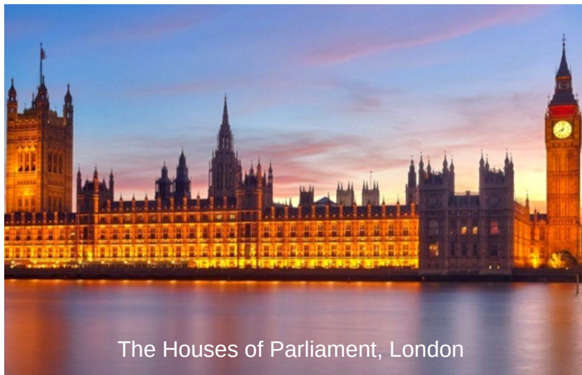
The Houses of Parliament, London

These are a very popular part of our course, and give students an opportunity to use their English as well as learn more about Great Britain. Students have the opportunity to learn more about the trip during lessons. Students travel by coach or train to these destinations. Activity leaders will brief students to follow certain rules for their own safety. On our return, a late dinner will be served.