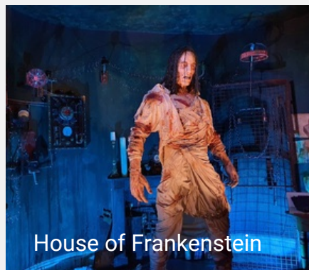
House of Frankenstein