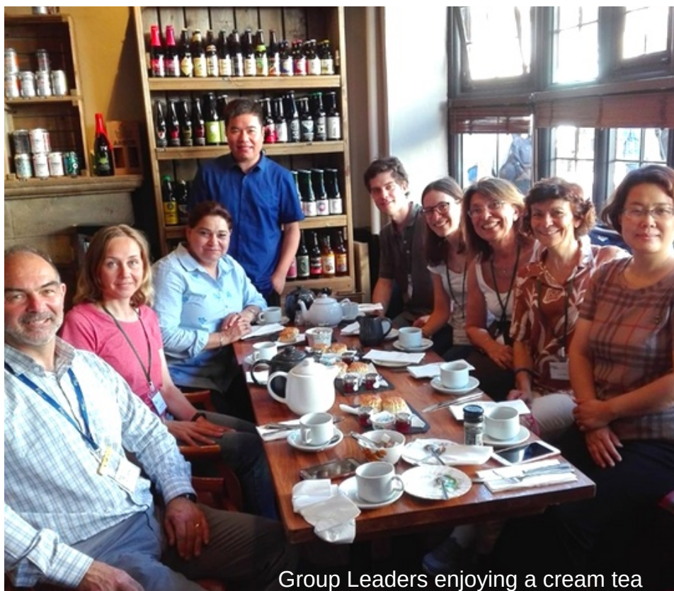
Group Leaders enjoying a cream tea

Elac has a dedicated office and its location will be given out when students arrive. There is also a Group Leaders room on-site where Group Leaders can relax and have access to tea and coffee.