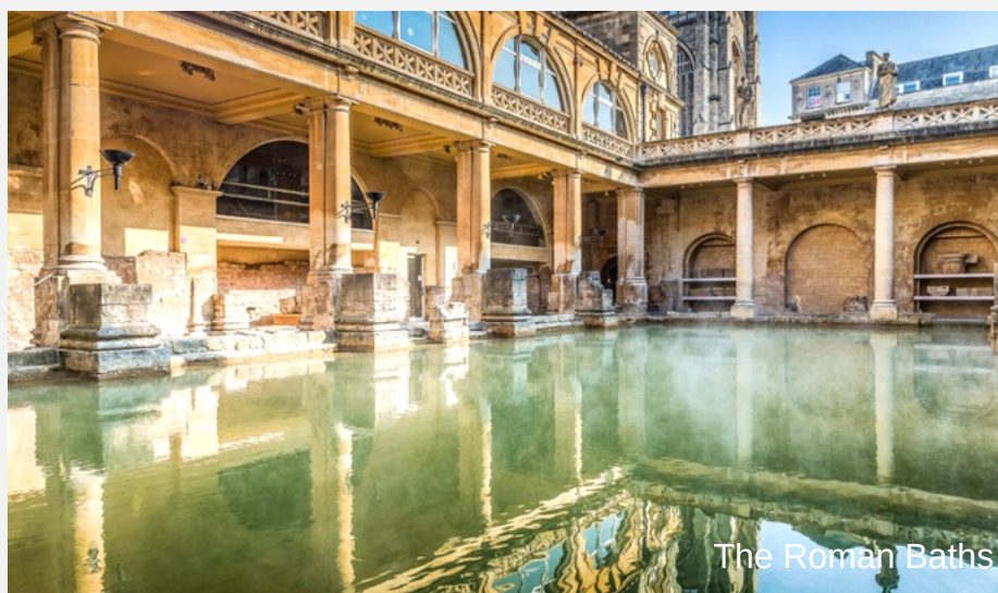
The Roman Baths

*These venues have entrance fees so there will be an additional cost: please talk to the activity manager for more details.