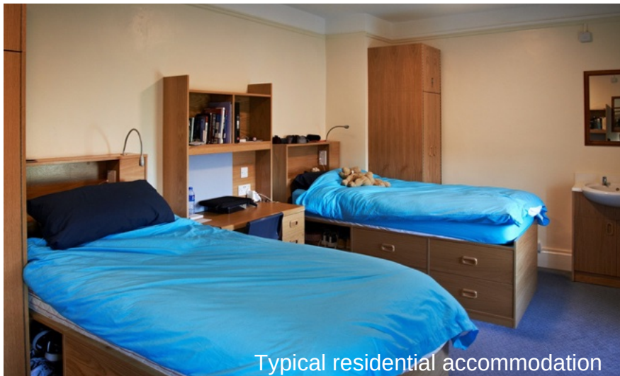
Typical residential accommodation

Students travel to and from the College on private or public buses, which is unsupervised.