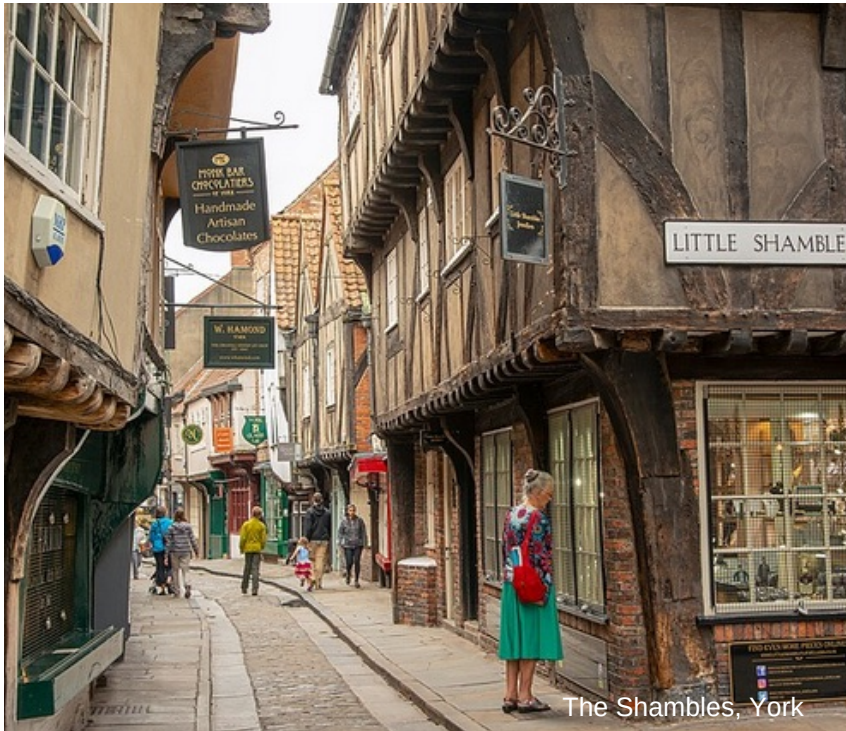
The Shambles, York

York, famous for its ancient Gothic Minster, is a two hour coach trip from Nottingham. Students have a walking tour of this historic walled city. They visit “The Shambles”, unique streets largely unchanged from the Middle Ages with overhanging timber-framed houses, as well as the Minster.