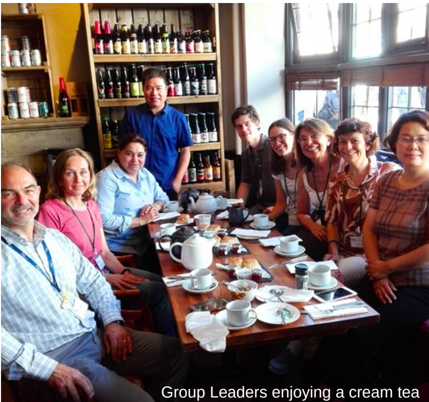
Group Leaders enjoying a cream tea

Elac has a dedicated office and its location will be given out when students arrive. There is also a Group Leaders room on-site where Group Leaders can relax and have access to tea and coffee.