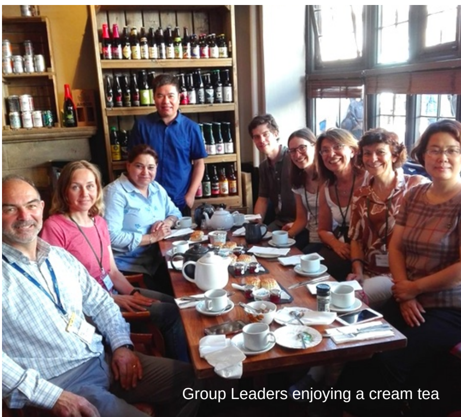
Group Leaders enjoying a cream tea

Elac has a dedicated office and its location will be given out when students arrive. There is also a Group Leaders room on-site where Group Leaders can relax and have access to tea and coffee.