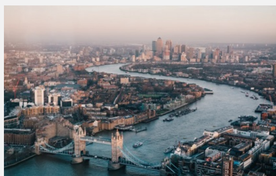
London from the air