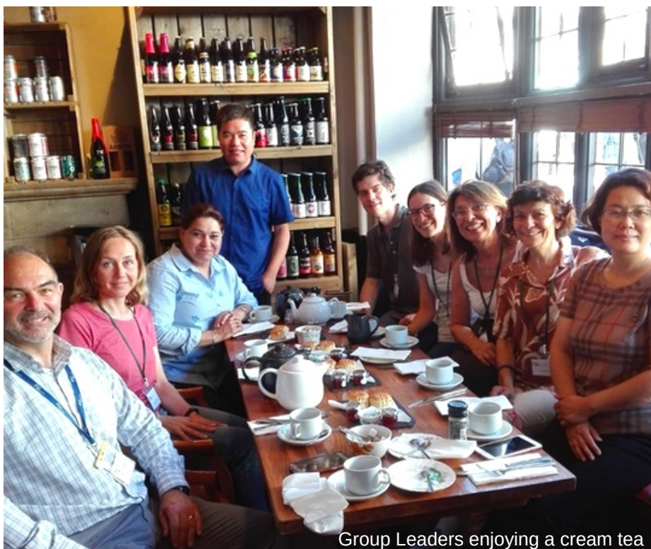
Group Leaders enjoying a cream tea

Elac has a dedicated office and its location will be given out when students arrive. There is also a Group Leaders room on-site where Group Leaders can relax and have access to tea and coffee.