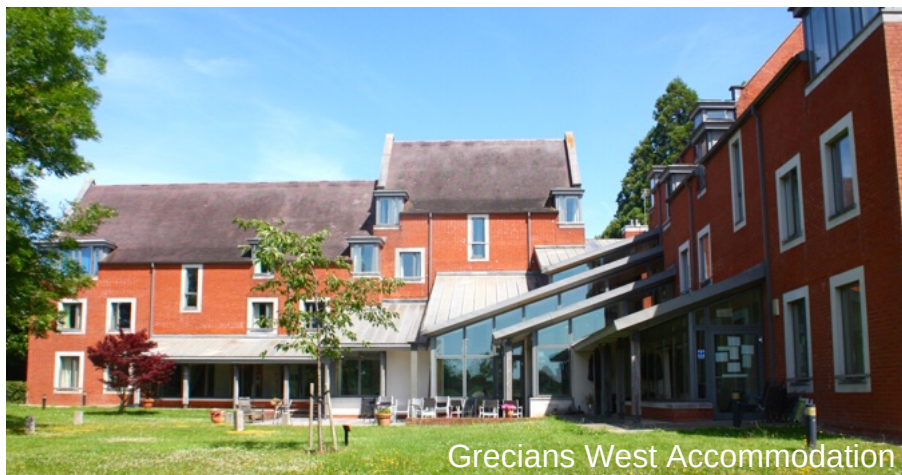
Grecians West Accommodation

The houses are all quite similar in design offering a mixture of shared rooms and singles, with shower blocks on every corridor. Disabled access rooms are available. Rooms sleep from 1 to 4, with single rooms for group leaders. There are spacious social areas available in every boarding house. The sixth form accommodation (Grecians) is more modern and all rooms are single with a sink in each room. Bedding is provided but students need to bring their own towels. The accommodation is a few minutes' walk from the dining hall and classrooms.