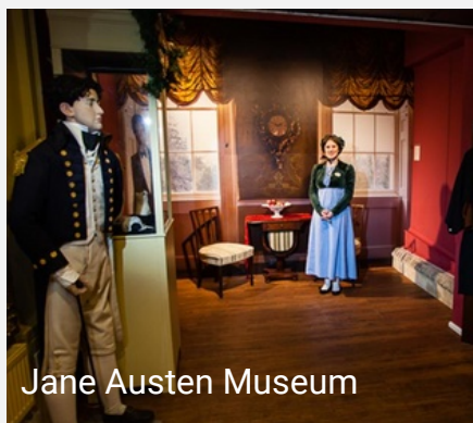
Jane Austen Museum

There will also be time for some shopping, or you may want to organize rowing or punting on the River Isis (* additional cost).