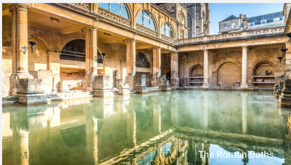
The Roman Baths

*These venues have entrance fees so there will be an additional cost: please talk to the activity manager for more details.