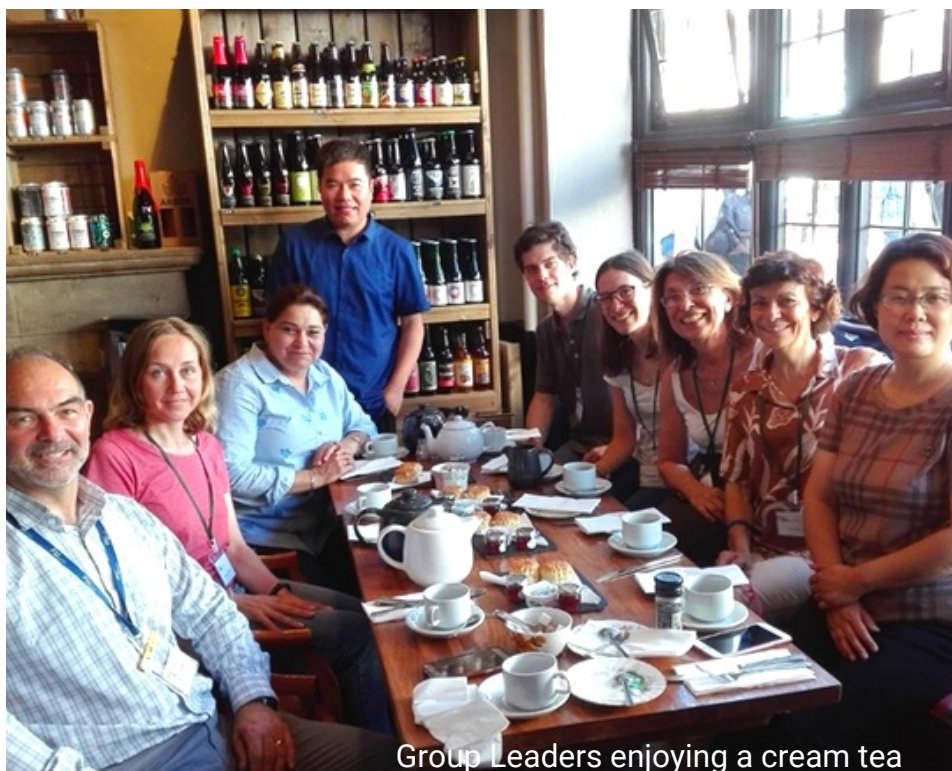
Group Leaders enjoying a cream tea

Elac has a dedicated office and its location will be given out when students arrive. There is also a Group Leaders room on-site where Group Leaders can relax and have access to tea and coffee.