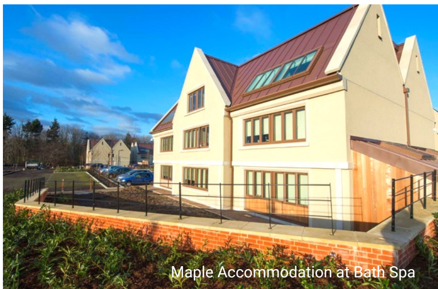
Maple Accommodation at Bath Spa

Modern facilities include state-of-the-art classrooms, ICT, and both indoor and outdoor spaces for drama, art and music, as well as sports fields. There are plenty of green areas for studying and relaxing.