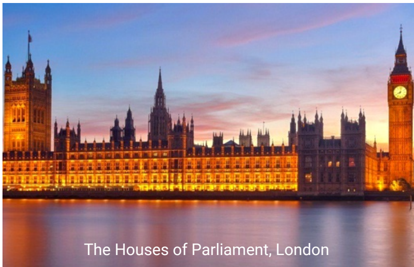
The Houses of Parliament, London

These are a very popular part of our course, and give students an opportunity to use their English as well as learn more about Great Britain. Students have the opportunity to learn more about the trip during lessons. Students travel by coach or train to these destinations. Activity leaders will brief students to follow certain rules for their own safety. On our return, a late dinner will be served.