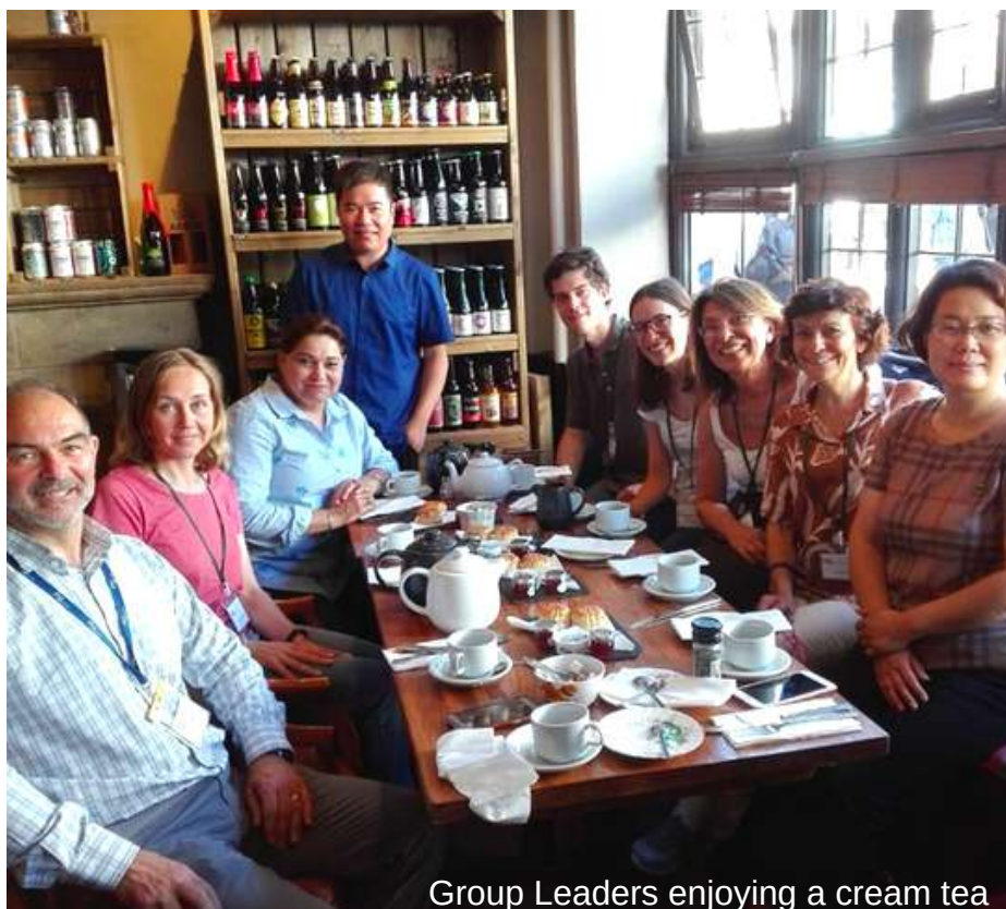
Group Leaders enjoying a cream tea

Elac has a dedicated office and its location will be given out when students arrive. There is also a Group Leaders room on-site where Group Leaders can relax and have access to tea and coffee.