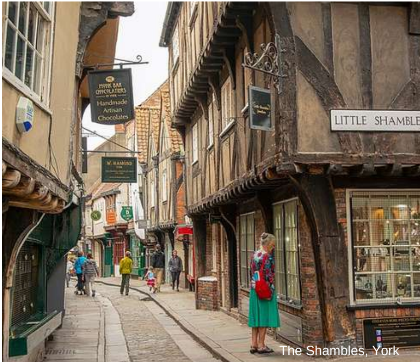
The Shambles, York

York, famous for its ancient Gothic Minster, is a two hour coach trip from Nottingham. Students have a walking tour of this historic walled city. They visit "The Shambles", unique streets largely unchanged from the Middle Ages with overhanging timber-framed houses, as well as the Minster.