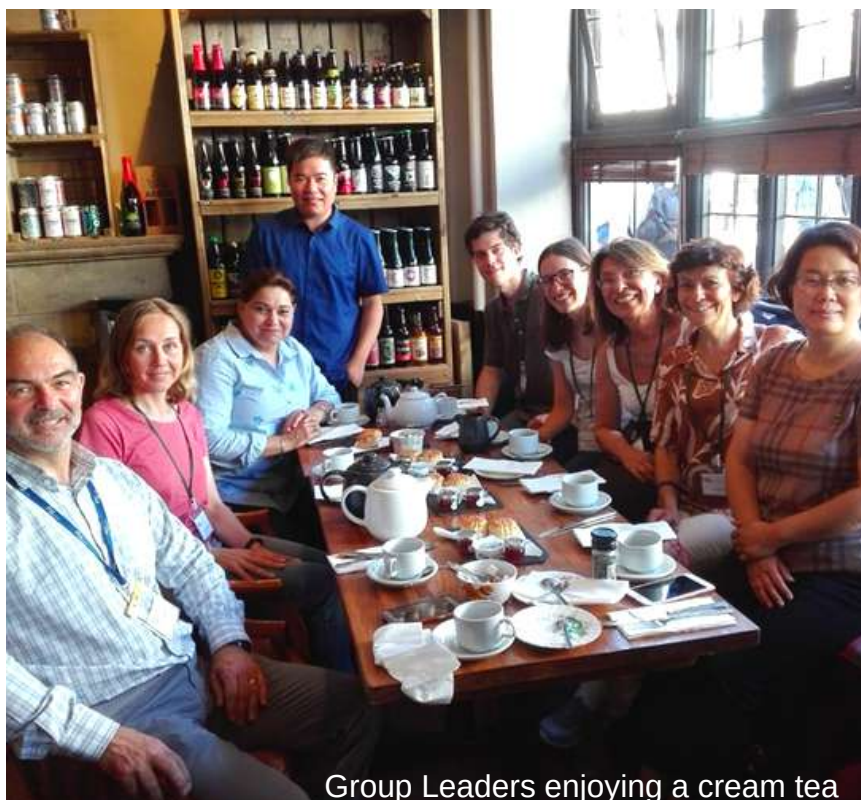
Group Leaders enjoying a cream tea

Elac has a dedicated office and its location will be given out when students arrive. There is also a Group Leaders room on-site where Group Leaders can relax and have access to tea and coffee.