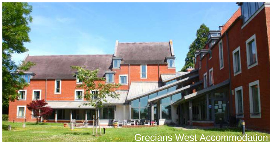
Grecians West Accommodation

The houses are all quite similar in design offering a mixture of shared rooms and singles, with shower blocks on every corridor. Disabled access rooms are available. Rooms sleep from 1 to 4, with single rooms for group leaders. There are spacious social areas available in every boarding house. The sixth form accommodation (Grecians) is more modern and all rooms are single with a sink in each room. Bedding is provided but students need to bring their own towels. The accommodation is a few minutes' walk from the dining hall and classrooms.