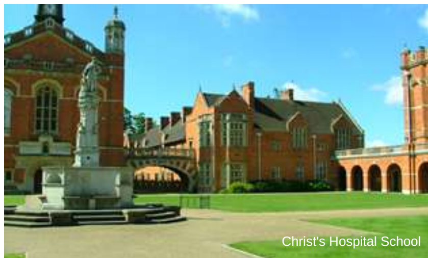
Christ's Hospital School

The school also boasts a stunning theatre modelled on Shakespeare's Globe Theatre. The school offers a wealth of excellent, modern facilities including spacious classrooms, a large sports centre, an indoor swimming pool, Astroturf sports pitch and numerous playing fields. There is a railway station in the village offering easy access to London, Brighton and other destinations.