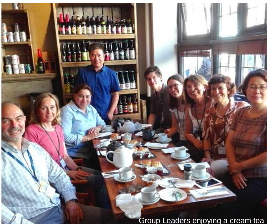
Group Leaders enjoying a cream tea

Elac has a dedicated office and its location will be given out when students arrive. There is also a Group Leaders room on-site where Group Leaders can relax and have access to tea and coffee.