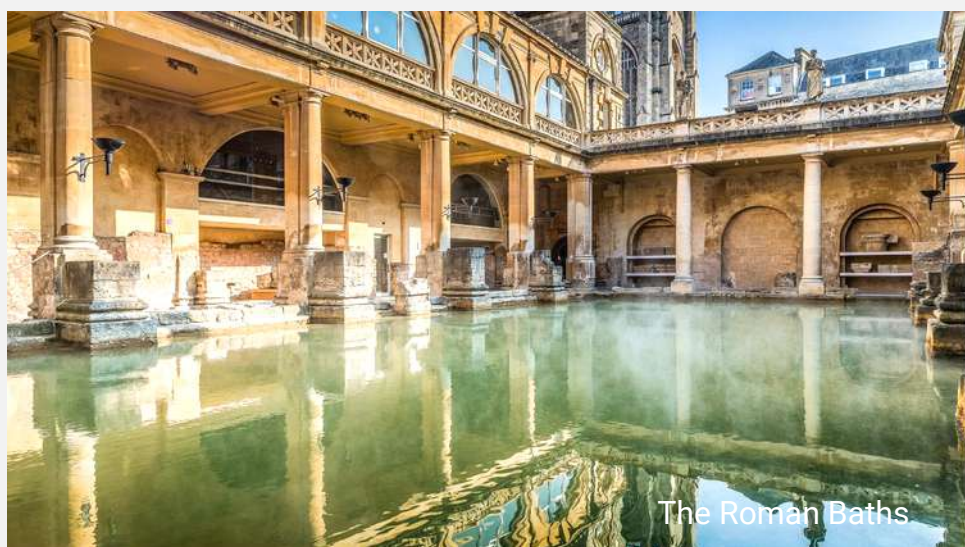
The Roman Baths

*These venues have entrance fees so there will be an additional cost: please talk to the activity manager for more details.