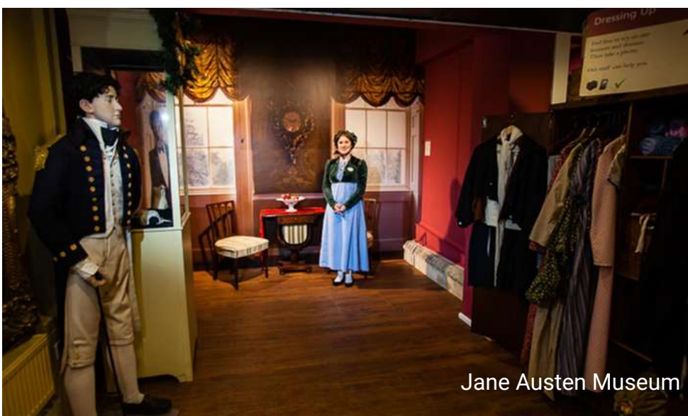
Jane Austen Museum

There will also be time for some shopping, or you may want to organize rowing or punting on the River Isis (* additional cost).