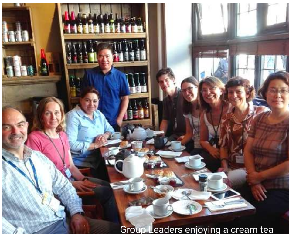
Group Leaders enjoying a cream tea

Elac has a dedicated office and its location will be given out when students arrive. There is also a Group Leaders room on-site where Group Leaders can relax and have access to tea and coffee.