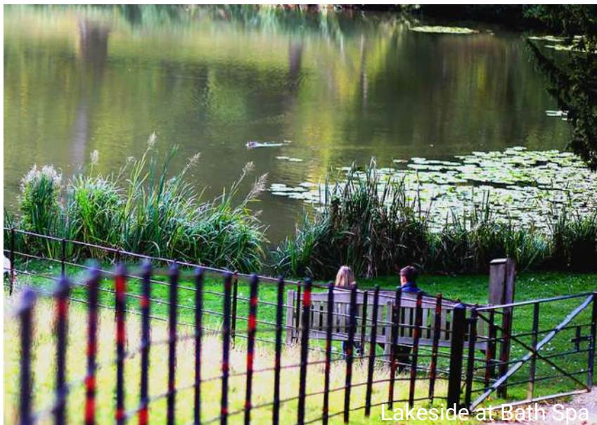
Lakeside at Bath Spa

Bath's location is close to many great places of interest such as Bristol, Oxford, Stonehenge and Glastonbury. Bath also benefits from the fast train service to London every half hour.