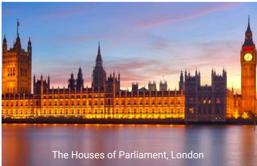
The Houses of Parliament, London

These are a very popular part of our course, and give students an opportunity to use their English as well as learn more about Great Britain. Students have the opportunity to learn more about the trip during lessons. Students travel by coach or train to these destinations. Activity leaders will brief students to follow certain rules for their own safety. On our return, a late dinner will be served.