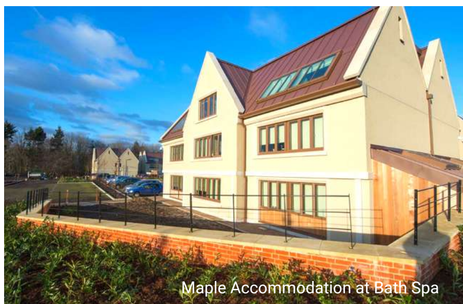
Maple Accommodation at Bath Spa

Modern facilities include state-of-the-art classrooms, ICT, and both indoor and outdoor spaces for drama, art and music, as well as sports fields. There are plenty of green areas for studying and relaxing.